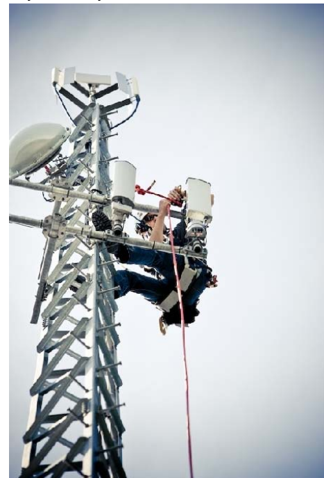
City of Sandy

As a city moves forward with a broadband project, it is important to consider all resources available to the city and assess how these resources can be used to support a new broadband service. For example, is there IT equipment that can be used to support or back up the