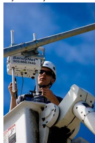
City of Sandy

As previously mentioned, Sherwood has four staff members supporting Sherwood Broadband which is the equivalent of a half-time employee. In addition, the city has a contract with an on-call network contractor who can respond to outages or other network issues that arise when city staff are not available (see case study, page 27).