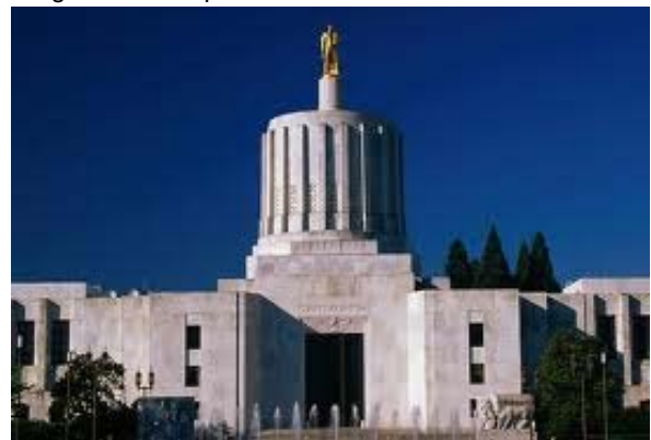
Oregon State Capitol

Currently in Oregon there are no state preemptions on municipal broadband services. However, there have been unsuccessful legislative efforts to prohibit or limit local government authority. Authorities in telecommunications law and politics