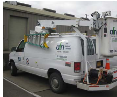
City of Ashland

If cities are only providing a free Wi-Fi service, it is best if there is already staff available who have the time and skill to maintain the equipment. It is not cost-effective to hire new staff to maintain a free service. A city could also consider a contract for the provision of Wi-Fi services to the public (see Contract Services/Equipment section below).